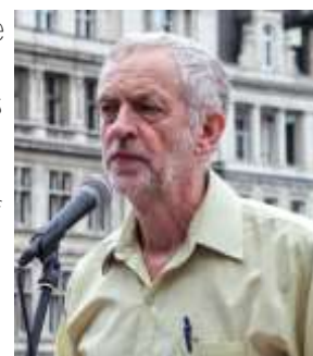
Leader of Her Majesty's Loyal Opposition

Instead of talking about working class unity Corbyn responded to this with the statement that he would agree to talks and recognised his "responsibility to represent the people that supported Labour in the last election and the people who didn't support Labour." Instead of pressing ahead with a no confidence motion in the government, he now commits himself to "national unity".